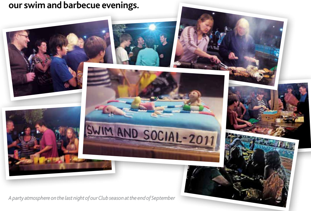
A party atmosphere on the last night of our Club season at the end of September

Now that the nights have drawn in and the leaves are falling it is difficult to remember that just a few weeks ago we were having our swim and barbecue evenings.