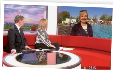
<< The BBC's Carol Kirkwood returned to Hampton Pool in April to present the weather for BBC Breakfast

Not only do we regularly appear in lists highlighting the best outdoor pools in the UK but we're also on the location lists for television producers. The sharp eyed amongst you may have noticed that the Channel 5 programme The Gadget Show visited us to test out new cutting edge technology whilst Carol Kirkwood broadcast her BBC early morning weather forecast updates across all BBC outlets (live Breakfast TV, BBC Radio, online and on social media) in April. Thankfully it was a beautiful morning for the live TV weather forecasting and the pool looked resplendent.