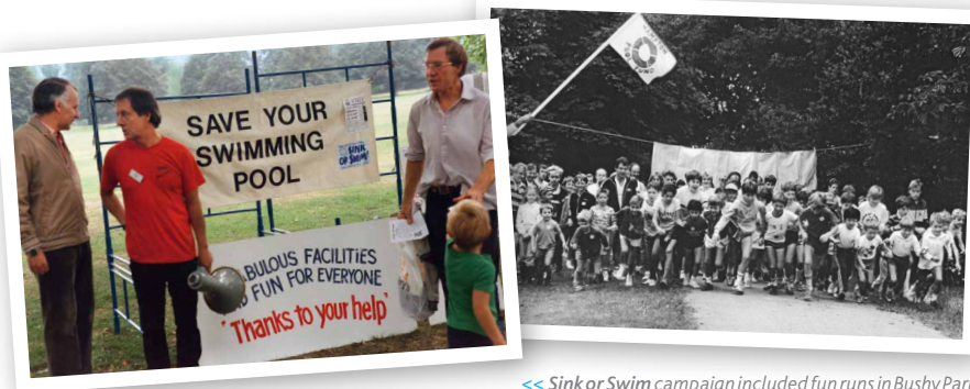
<< Sink or Swim campaign included fun runs in Bushy Park

<< continued from front cover There have been many other fundraising initiatives over the years that have led to the installation of the children's pool and the refurbishment of the main pool and the building. The day-to-day running of the pool was organised by the volunteers and as the popularity of the pool grew so did the amount of work to be done.