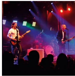
World class artists in Hampton this summer. Left to right row 1: Heaven 17; row 2: The Shires, The Christians and The Feeling; row 3: Toploader and Dodgy.