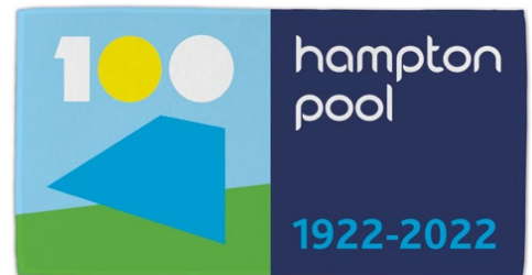
Centenary branded 140cm x 70cm luxury poly-cotton/cotton towel £15 .

They include the gorgeous print of Hampton Pool and tote bag designed by Lisa Tolley ! We also have centenary branded towels and swim hats available from Hampton Pool shop. All surplus from sales help secure the future of Hampton Pool. ≈