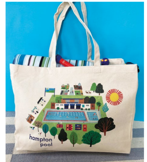
Lisa Tolley tote bag ideal for swim gear or shopping £15 .