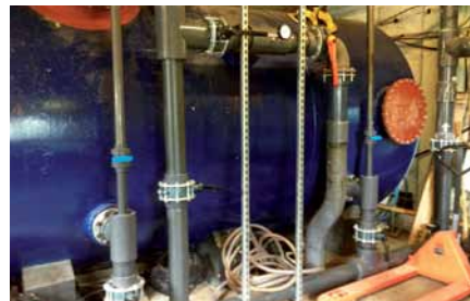
New pipe work and valves on the main pool filter tank

For the main pool, we emptied the old sand from the filters, relined the inside of the tanks, refilled them with a new silica based media and replaced the front pipework and valves.