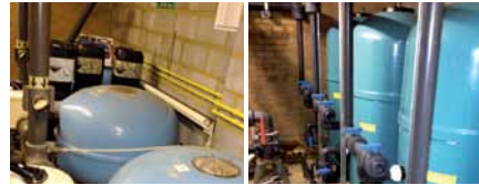
Old learner pool filters New taller filters

YMCA LSW has fitted brand new filters in the learner pool plant room. We now have four filters which are twice the height of the three old ones that will give us better filtration and therefore improving our water and our backwashing.