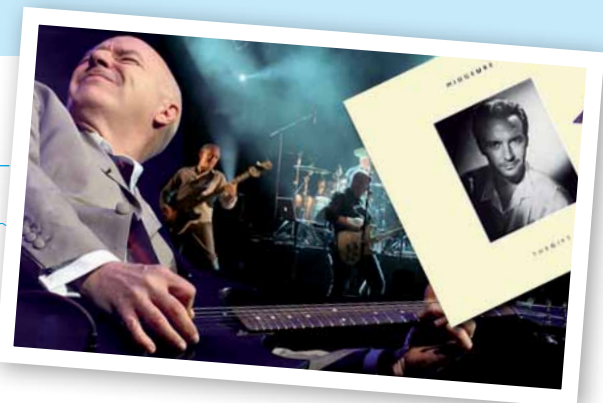
Midge Ure and band play Hampton Pool on Friday 26 July

Friday 26 July opens with The Chuck Farley Band , described as R'n'B mixed with hints of Little Feat, Ry Cooder and The Band and always a delight to get you in the mood for a great evening with the iconic Midge Ure . Midge is playing with his full band in the intimate setting of our lawn, set off by the glorious pools in the background. On the Saturday, we have