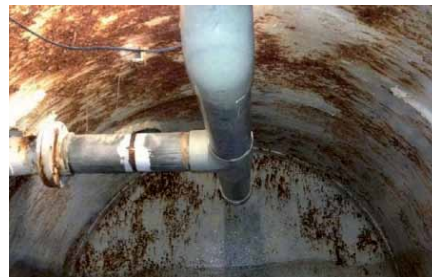
The inside of the emptied main pool filter tank

This work has cost a large amount of money. Although it's something hidden in the plant rooms and you are unlikely to see the sort of difference it makes, it is essential to the running of the pools. The filter media has to be replaced every seven to 10 years. There will be more work to do on the plant rooms in the near future.